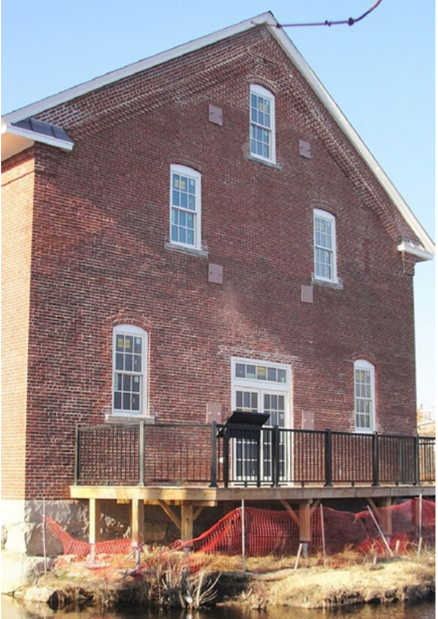
MCA Museum with Windows and New French Door Installed. Moving Forward Toward our goal!