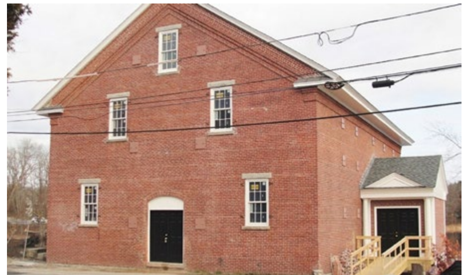
Wires spanning the front of 2 Old Elm Street

kitchen, doors which open outward, double toilets – all of which take up space. We have done our best.