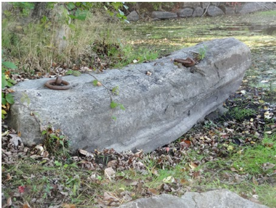
Anchor stone of the floating towpath

Good weather and the continuing optimism that the pandemic may at last be winding down brought out approximately 35 walkers eager to walk and with plenty of questions and curiosity.