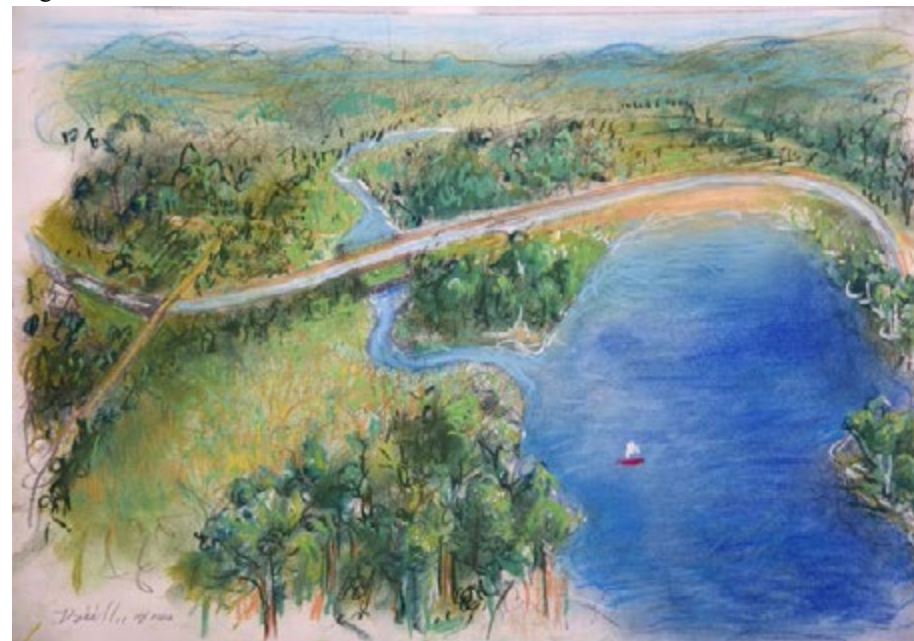
Middlesex Canal Crossing the Symmes River, part of the water highway between Boston Harbor and Concord, NH. Pastel by Thomas Dahill for the program at the Winchester Historical Society, October 18, 2016. The artist has captured the sweep of the canal across the land, so very different than the rutted, hilly dirt roads.

The importance of the harbor-water highway combination is manifested in the 1790 census wherein the five locations above are the five largest population centers in the United States. In 1860, with New Orleans replacing Charleston, they were still the largest.