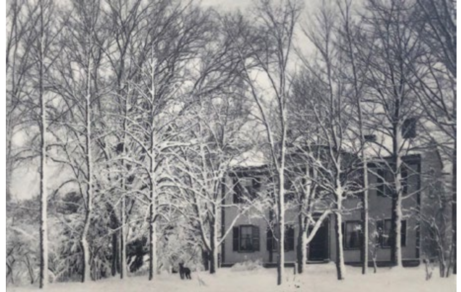
This picture appeared on the Reading Municipal Light Department calendar.

Doric pilasters, a transom light, and a central attic gable with a blind fan detail. The house is now part of the Centre Village Historic District.